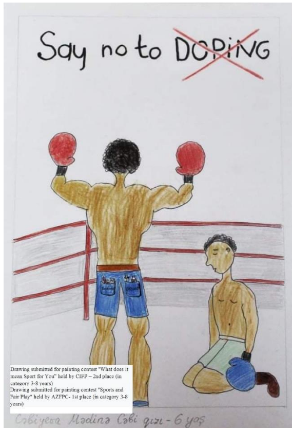
Drawing submitted for painting contest "What does it mean Sport for You" held by CIEP - 2nd place (in category 3-8 years) Drawing submitted for painting contest "Sports and Fair Play" held by AZFPC- 1st place (in category 3-8 years)