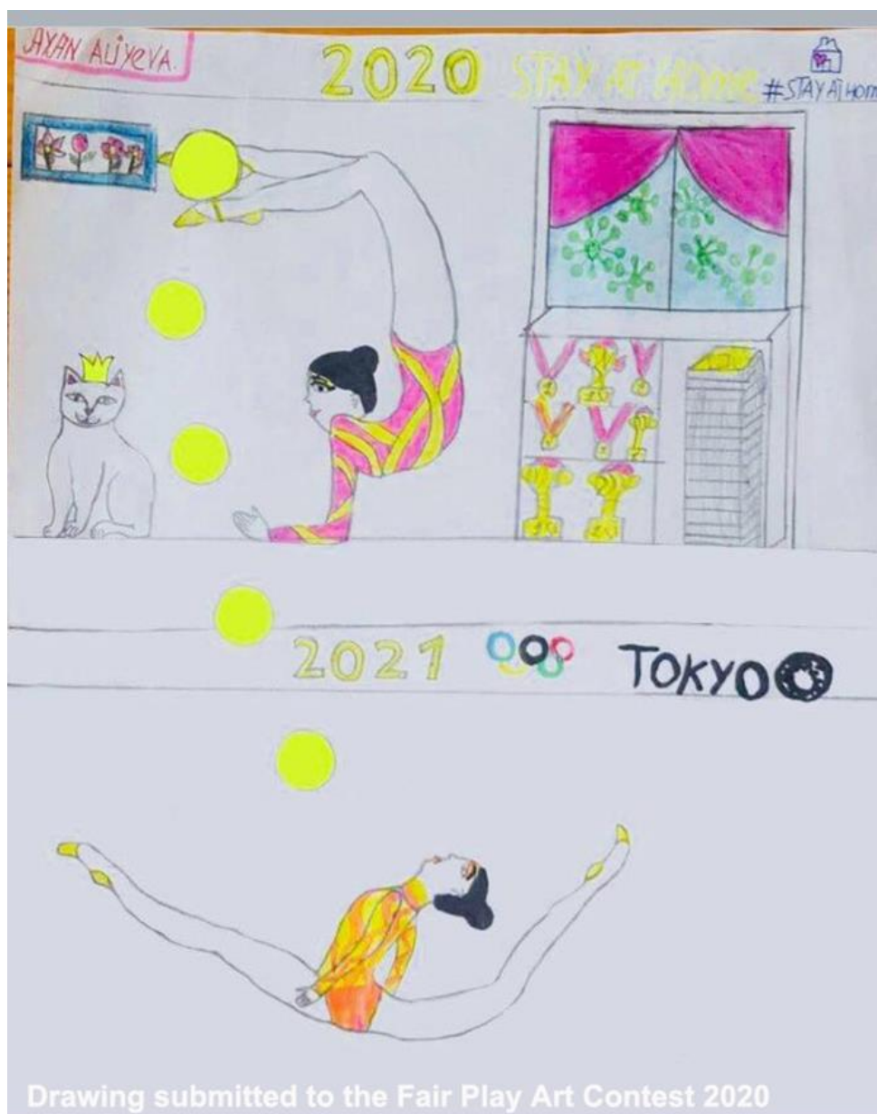
Ayan, 11, Azerbaijan