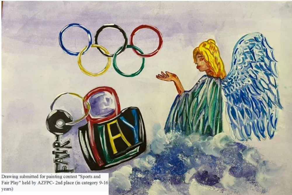
Drawing submitted for painting contest "Sports and Fair Play" held by AZFPC- 2nd place (in category 9-16 years)