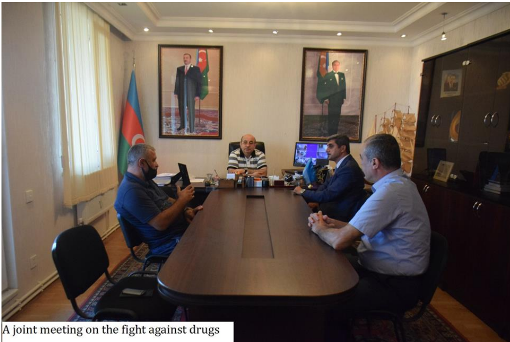
A joint meeting on the fight against drugs