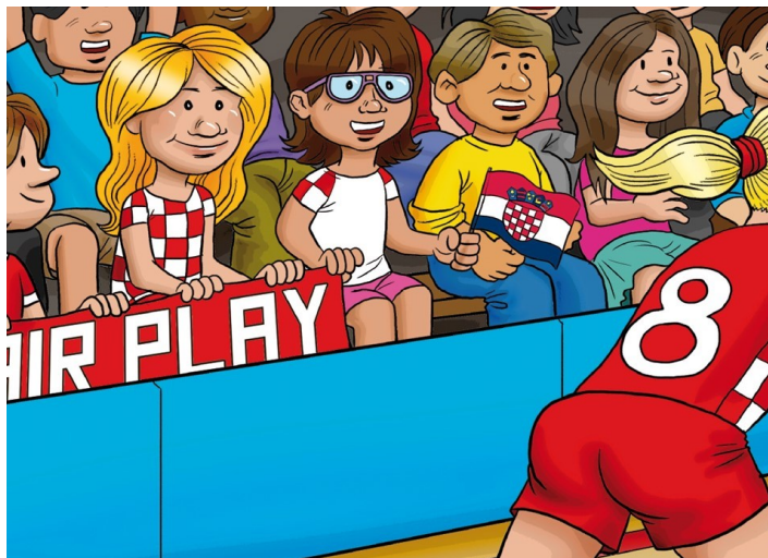
Caricature from the Sports Code of Conduct for pre-school children

2.) The Sports Code of Conduct for school and pre-school children is prepared and published in cooperation between Central State Office for Sport and CFPC, in 2018, for the activities in 2018 and 2019.