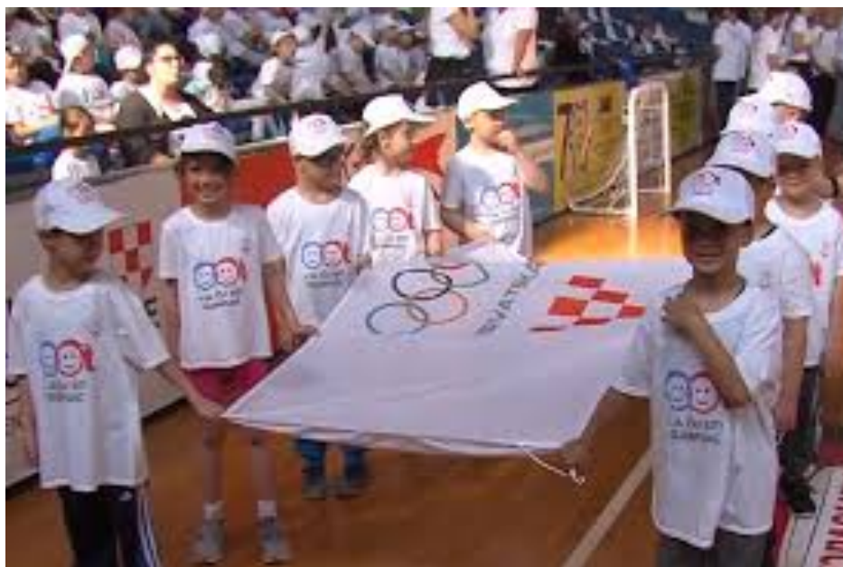
Competition of children at the Kindergarten Olympic Festival, Split, 2019

3.) The COC pays special attention to fair play values during special children's programmes. Under the motto "Što se nauči u djetinjstvu nikad se ne zaboravlja" („You never forget what you learn in childhood”), since 2002 the Croatian Olympic Committee has organized a national project of affirmation of Olympic values with the youngest children through the "Croatian Kindergarten Olympic Festival". Since 2007, the festival has been taking place under the motto "I ja ću biti olimpijac" („I too will be an Olympian”), and every year it gathers more than 15,000 pre-school children, all wearing T-shirts bearing the inscription FAIR PLAY. Every child aged 5 or 6 who attends one of Croatian kindergartens has the right to participate in the Festival.