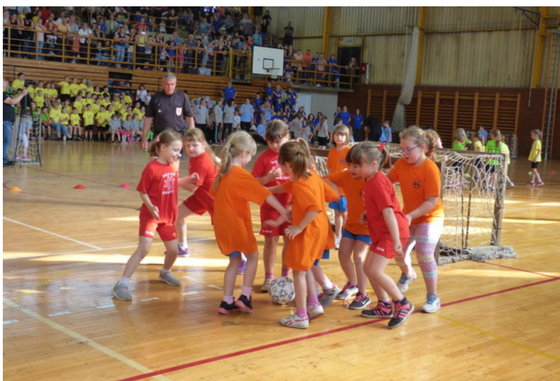
Competition of children at the Kindergarten Olympic Festival, Sisak 2018

3.) The COC pays special attention to fair play values during special children's programmes. Under the motto "Što se nauči u djetinjstvu nikad se ne zaboravlja" („You never forget what you learn in childhood”), since 2002 the Croatian Olympic Committee has organized a national project of affirmation of Olympic values with the youngest children through the "Croatian Kindergarten Olympic Festival“. Since 2007, the festival has been taking place under the motto "I ja ću biti olimpijac" („I too will be an Olympian”), and every year it gathers more than 15,000 pre-school children, all wearing T-shirts bearing the inscription FAIR PLAY. Every child aged 5 or 6 who attends one of Croatian kindergartens has the right to participate in the Festival.