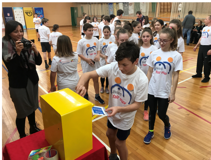
During a physical education class the pupils send by post picture postcards having fair play messages

Here is a brief report on the CFPC activities during 2018: