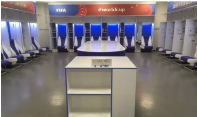
Locker room at Rostov Arena after the departure of Japanese football players

sent the following message to the Japanese Embassy in Zagreb: “We are pleased to inform you that the Japanese fans and football players have been proclaimed the greatest fair play promoters at the World Football Championship in Russia by the Croatian Fair Play Committee. The gesture of fans and players, that is, cleaning tribunes and locker rooms at Rostov Arena, after the match with Belgium, on 2 July 2018, showed to the entire world that sport can be even nicer than it really is ...” Svjetsko prvenstvo u nogometu ove godine kao najznačajnije sportsko natjecanje, mnogim je zbivanjima slalo svoje poruke javnosti.