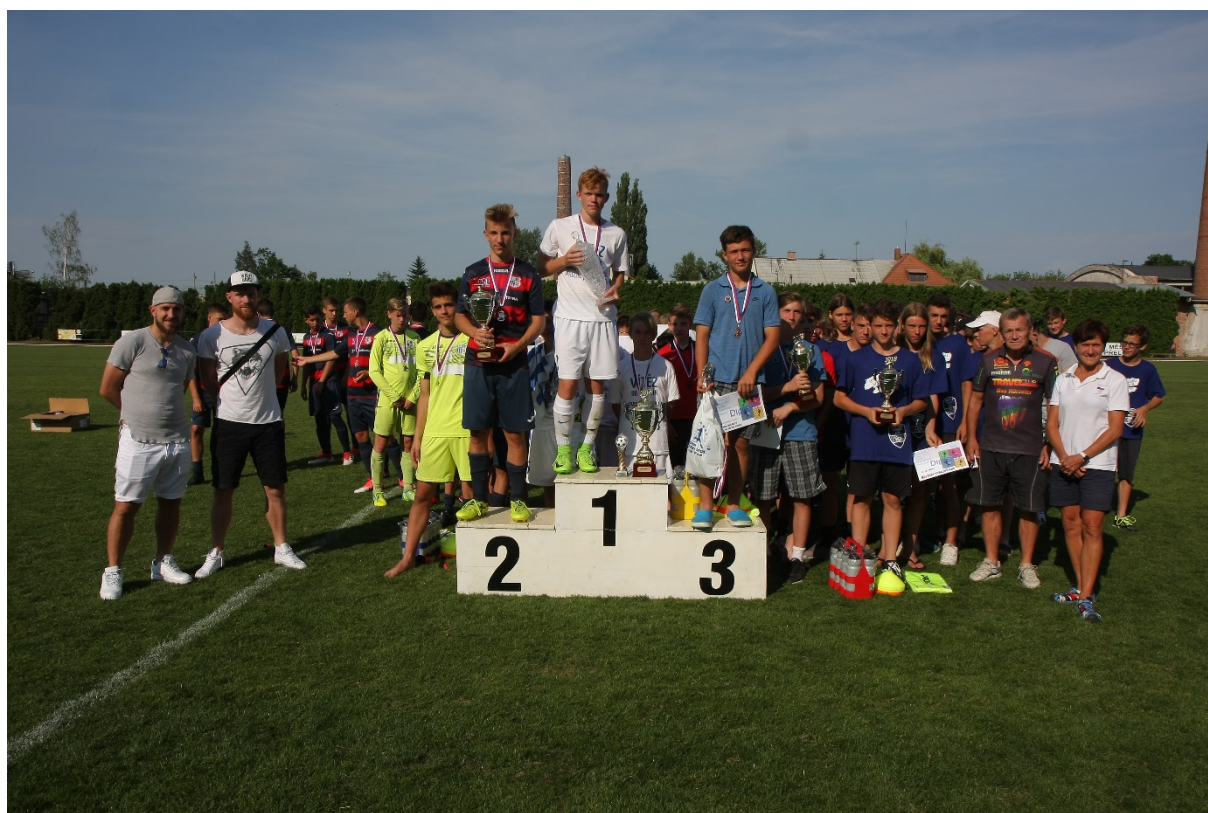
Přelouč – international football tournaments for juniors, with FP award