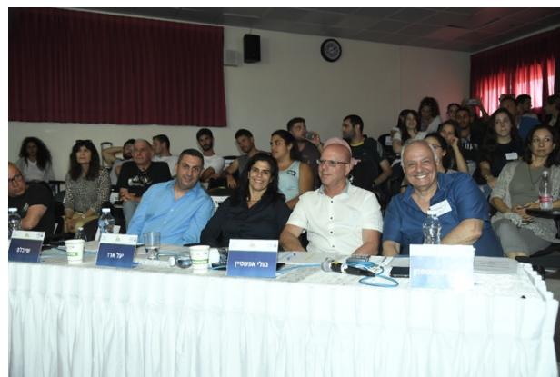
Mr. Gili Lustig, CEO of the Olympic Committee of Israel Judges' panel of the 2019 Israel Olympic Quiz