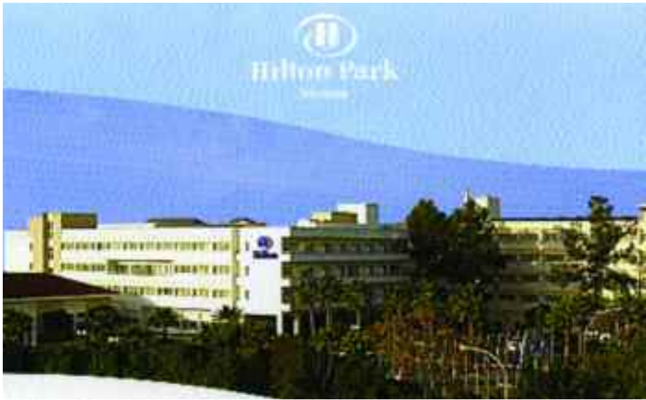
The Hilton Hotel in Nicosia - the venue for the 14th European Fair Play Congress.

Technical matters The body in charge of preparations is the Organising Committee. Their initial aims are to identify and engage