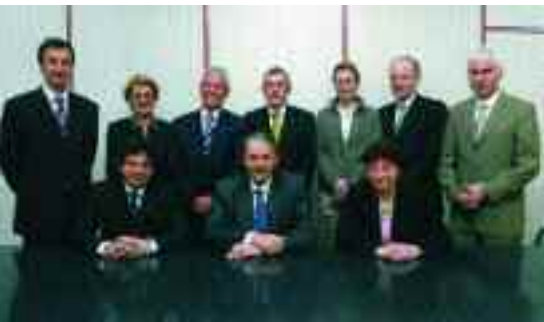
Members of the Luxembourg National Olympic Committee with IOC President Dr. Jacques Rogge.