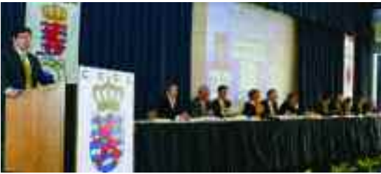
THE LUXEMBOURG OLYMPIC COMMITTEE'S GENERAL ASSEMBLY

tive Committee and expressed satisfaction with the way the country's sports infrastructure is developing. A detailed account of his visit was published in 'Flambeau', the official organ of the Luxembourg National Olympic Committee. Meanwhile, Luxembourg continues to undertake successful Fair Play activities in many different areas.