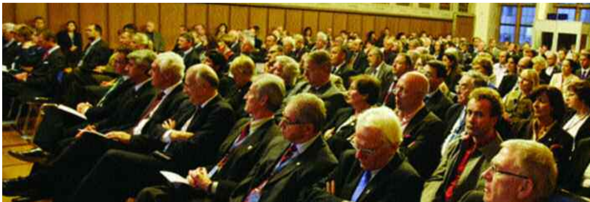
Opening of the 13th European Fair Play Congress in the historical Imperial Hall, the "Kaisersaal" in the town hall of the city of Frankfurt.