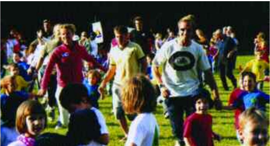
BIG AND SMALL: Famous Slovenian athletes were guests of honour at the JELKA Kindergarten during the ‘World Day of Sport’ event.