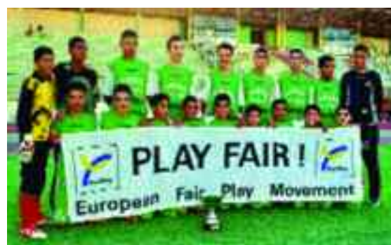
ON THE OTHER SIDE OF THE MEDITERRANEAN: Young Algerian football teams adopt the EFPMslogan 'Play Fair'.