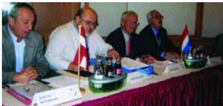
The EFPM Executive Committee at the General Assembly in Frankfurt.