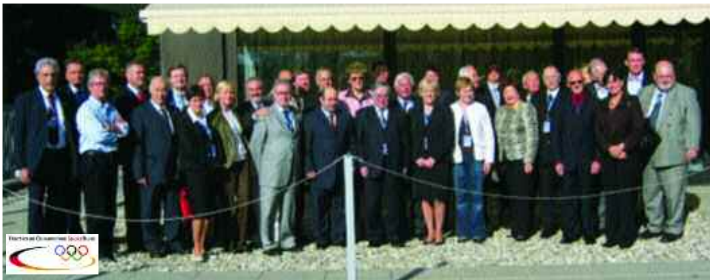
THE DELEGATES TO THE 13th EFPM GENERAL ASSEMBLY