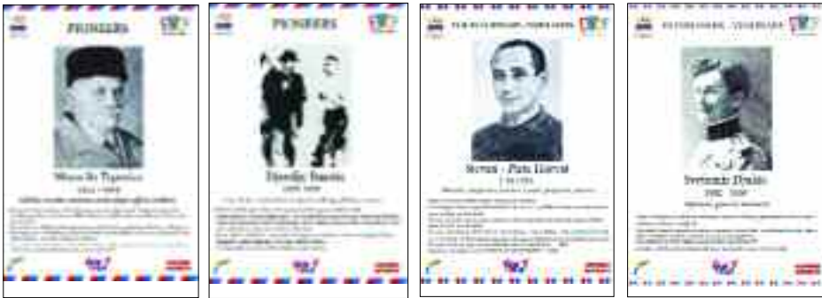
SERBIA'S OLYMPIC HEROES

BELGRADE- The goal of the Fair Play Commission of the Olympic Committee in Serbia is to spread the Olympic ideas and values. The Commission is composed of the following members: