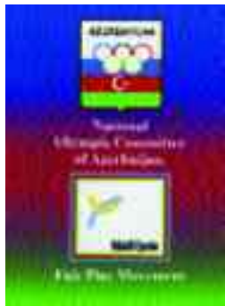
Azerbaijan's Fair Play Handbook.