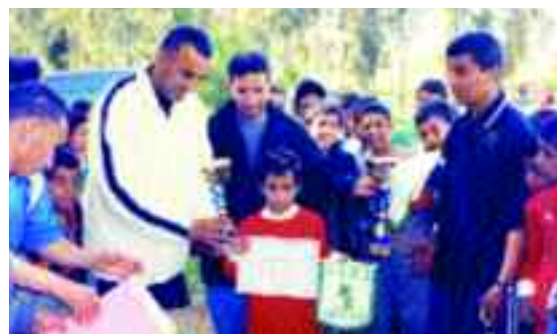
A FAIR PLAY AWARD: The most gentlemanly player at a junior championship receives a Fair Play Trophy and Diploma.