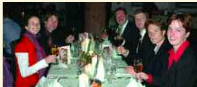
GOOD HEALTH! The people who prepared the way for the success of our Congress by their hard work raise their glasses on our last night – for a toast in their honour.

In the course of their tour of historic sites in Frankfurt, the EFPM delegates called at a famous monastery and were impressed both with the vineyards there and with the quality of the white wine produced.