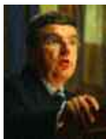
Dr. Thomas BACH

Dr. Thomas Bach, Vice-President of the IOC and President of the German Olympic Sports Confederation, underlined the significance of the Values of Sport.