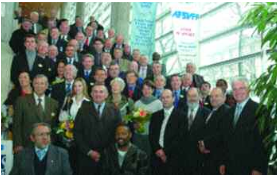
A GROUP PHOTOGRAPH FROM THE 'MAISON DU SPORT FRANÇAIS'.