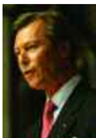
Grand Duke HENRI of Luxembourg

Guest of Honour and Keynote Speaker at the Opening of the 13th European Fair Play Congress, held in the historic Town Hall of the City of Frankfurt, the Römer, was a European Head of State and IOC Member: Grand Duke Henri of Luxembourg.