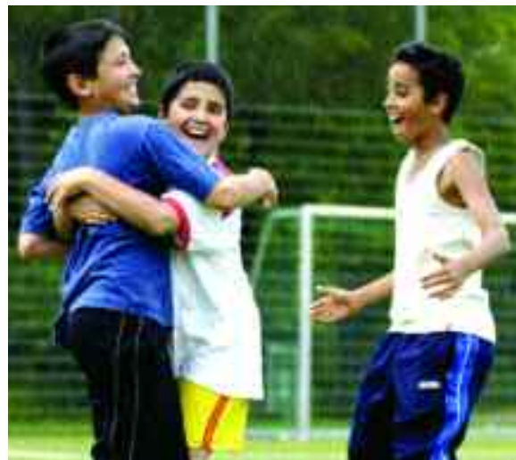
THIS IS HOW IT'S DONE: An example of the work of ASKÖ's Sports and Integration Project.

In spring 2007 the ASKÖ unit in the federal province of Salzburg started a similar project, focusing on the integration of young immigrants between 6 and 14 years of