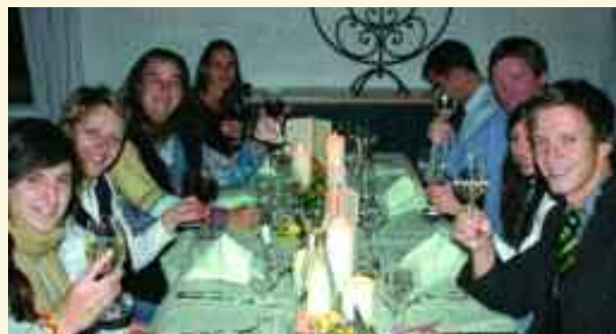
SMILING FACES: The people who organized everything for us in Frankfurt beam with pleasure on our last night, enjoying the results of all their efforts.