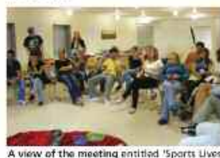
A view of the meeting entitled 'Sports Lives Diversity - Diversity Creates Europe'