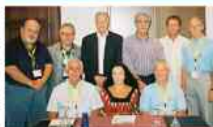
OCTOBER 2008: The EFPM Executive Committee at work in the Hilton Park Hotel before the 14th General As- sembly, at the conclusion of their 4-year term of office.