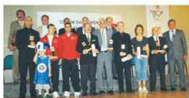
The winners of the Turkish Fair Play Awards after the ceremony at the Olympic House.

One of the awards presented at this ceremony was the EFPM Award made to the Turkish National Olympic Committee's Olympic and Sports Library. Guest of honour at the ceremony was Miroslav Cerar, Chairman of the EFPM Awards Jury. Mr. Cerar gave a short speech and was warmly applauded.