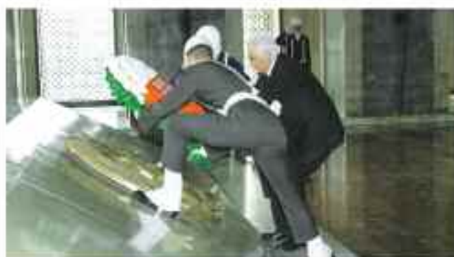
A WREATH FOR ATATÜRK: NOC President Togay Bayatlı places a wreath on the tomb of Atatürk at the Atatürk Mausoleum in Ankara.

At a special ceremony at the Fair Play Council's offices in Turkey's Olympic House, a copper plaque bearing portraits of these five people was hung up to commemorate the Fair Play Council's 27th birthday. Of the five founding members, two are still alive.