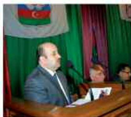
Khazar Isayev is Chairman of the Azerbaijan Fair Play Council.