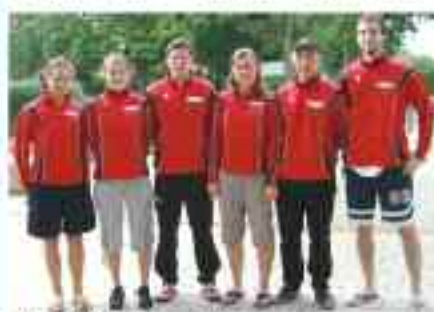
The ASKOE team in Hannover.

After a detailed evaluation of the EU-Commission an official letter from Brussels with the message "selected for funding" was sent to ASKOE headquarter in November 2008. For that reason ASKOE and its project partners from Italy, France, Slovenia, Estonia, Germany, Austria and the European Non-Governmental Sports Organisation (ENGSO) will work together closely on the topic "violence in sport clubs" in the years 2009 and 2010. This big EU-project will give the opportunity to learn more about the present situation in sport clubs all over Europe, to identify models of best practice, to produce educational and communicational materials, to make people aware of this topic and to disseminate the results. Overall the project "Violence in Sport Clubs" will give the whole Fair Play-family a chance to make new experiences with the European Union, the funding programme DAPHNE III and the above mentioned topic.