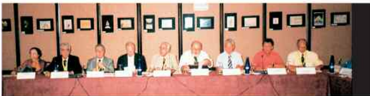
THE EFPM EXECUTIVE COMMITTEE AT THE 14th GENERAL ASSEMBLY