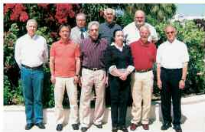
MAY 2008: The EFPM Executive Committee in the garden of the Hilton Park Hotel during their first meeting for 2008, held in Nicosia.