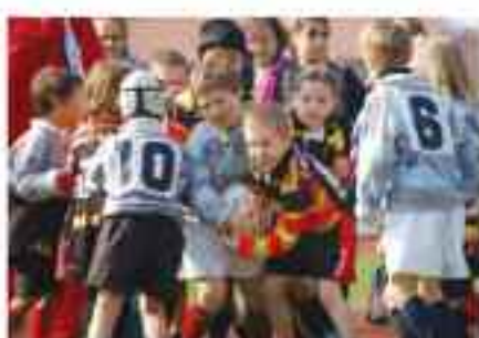
THE UNDER-13 RUGBY TEAM: While playing a game at Acqua Acetosa, Rome, these young rugby players also learned how to behave in accordance with the rules of Fair Play.