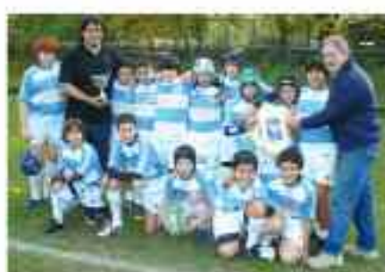
AN EXAMPLE TO ADULTS: The 'Fair Play in the Field' rugby match - a strenuously competitive game played with full attention to the rules of 'gentlemanly conduct'.