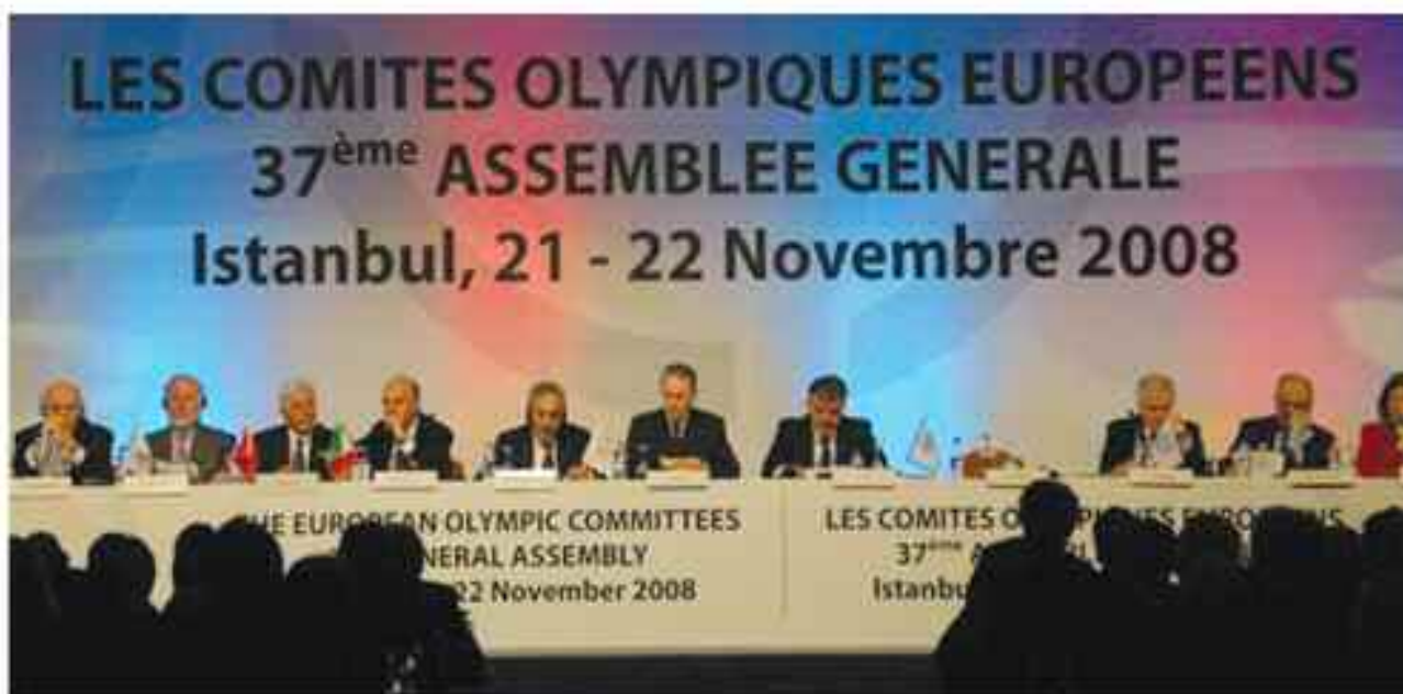
A SPEECH FROM THE PRESIDENT: Turkish President Abdullah Gül gave a speech at the 37th EOC General Assembly, which was held at the Çırağan Palace in Istanbul to mark the 100th anniversary of the foundation of Turkey's NOC.