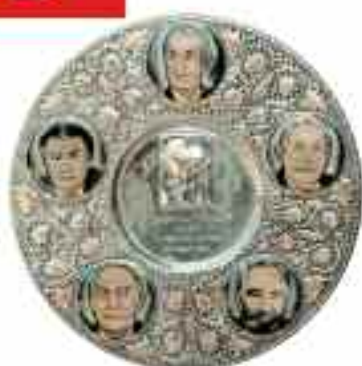
THE FAIR PLAY PLAQUE: The plaque commemorating the foundation of the Turkish Fair Play Council now hanging in Turkey's Olympic House.