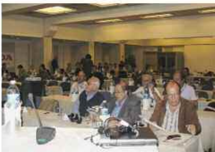
AT CRETE: view of the 2nd UEPS Sports Journalists' School meeting.

Over 300 sports journalists from more than 30 European countries were registered and attended the event, representatives from global media organizations and agencies as well as postgraduate students from all over the world. The School had as its target sports journalists under the age of 35. The five-day Seminar took place in ALDEMAR KNOSSOS OLYMPIAN VILLAGE Hotel in the Hersonissos peninsula, very close to the Heraklion City and it mainly focused on new technologies in the Sports Media. The invited speakers came from the