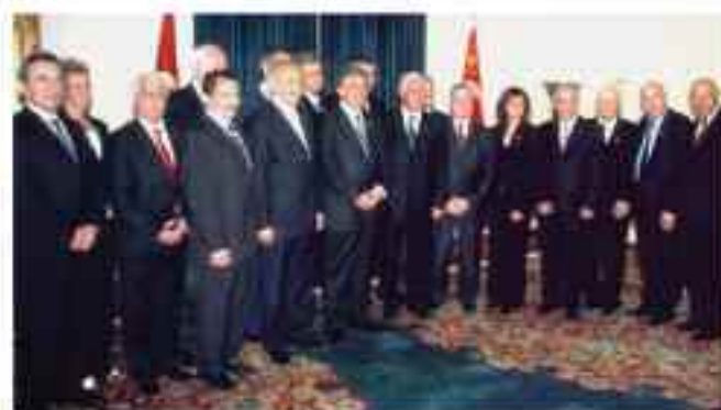
AN AUDIENCE WITH THE PRESIDENT: The reception for the National Olympic Committee of Turkey given by Turkish President Abdullah Gül at his official residence.