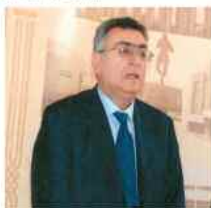
Gingiz Huseynzade is Vice-President of the Azerbaijan National Olympic Committee.