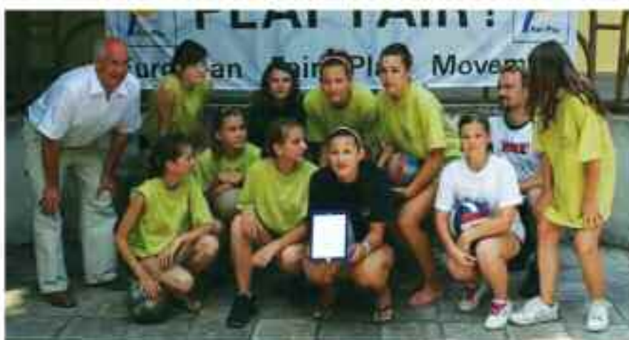
THE SPECIAL FAIR PLAY AWARD: of the European Fair Play Movement for outstanding sportsmanship and respectful manner over the course of the Kalokagatia, Olympic Games for Youth and Children, was presented to the Volleyball team ZS Poltar.

It is a great honour for the Fair Play Club of SOC that the fair play laureates of the pre-