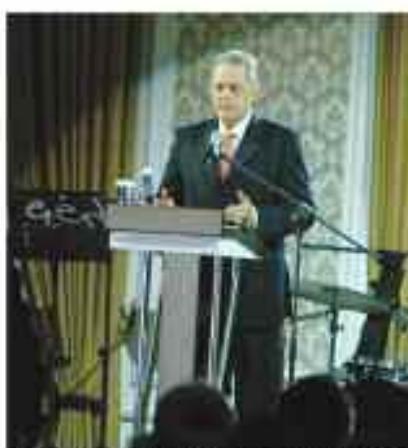
Dr. ROGGE: IOC President Dr. Jacques Rogge congratulated the NOC of Turkey on their successful organization of the event.

Speaking at the 37th EOC General Assembly, Turkish President Abdullah Gül