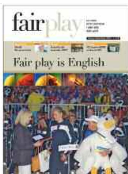
THE FAIR PLAY MAGAZINE: The cover of the English-language magazine produced by the Fair Play Committee of the Italian National Olympic Committee.

The Italian Fair Play Committee have begun to include news on Fair Play activities directed at children and young people in their publications. First, they published an article (with photographs) on the 'Lamberto Puccher' Rugby Tournament for children under the age of 13. This tournament is designed to teach children how to act fairly in an atmosphere of strenuous competition. In a later issue, they explored the subject of how Fair Play works in a sport with a high level of physical contact - rugby - in an article entitled 'Fair Play in the Field'. The activities of Messrs. Alcanterini and Tommaso have aroused a good deal of interest and appreciation not only in Italy but also in the other countries of Europe.