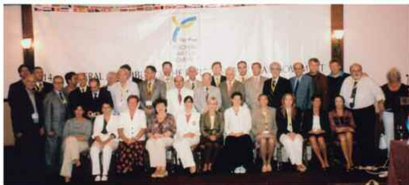
THE DELEGATES AT THE 14th EFPM CONGRESS IN NICOSIA, CYPRUS