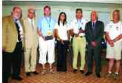
XIII GSSE FAIR PLAY AWARDS CEREMONY

The European Fair Play Individual Award was presented by the EFPM General Secre-