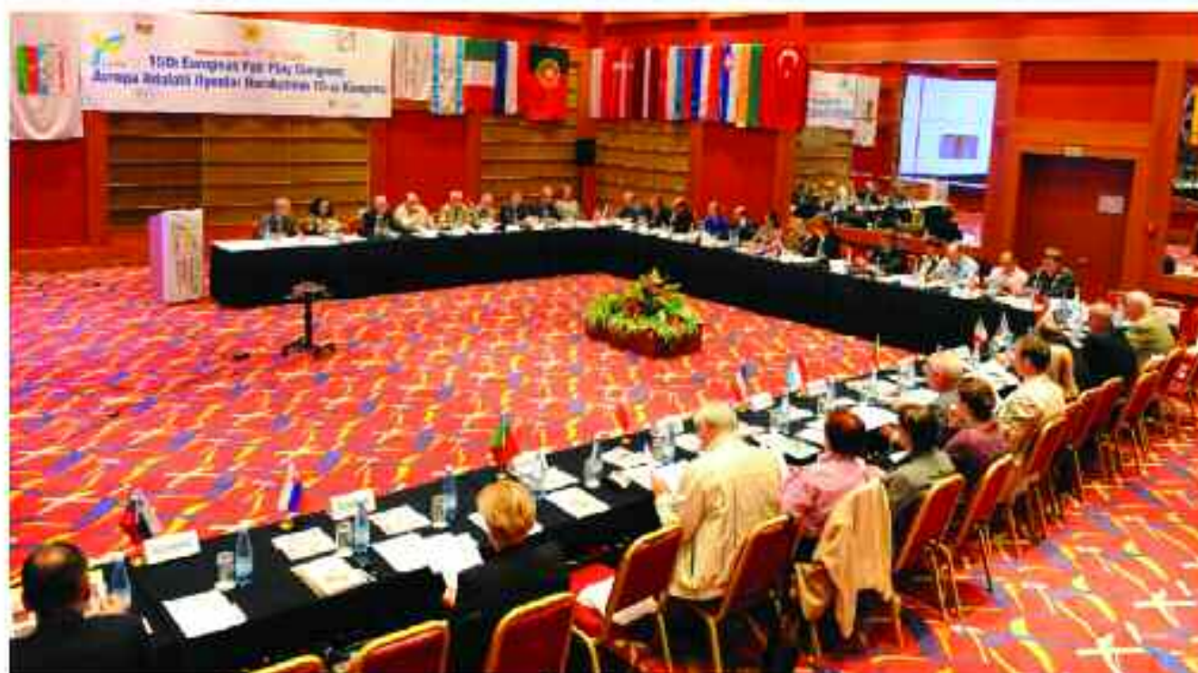
A VIEW OF THE 15th EFPM GENERAL ASSEMBLY IN BAKU