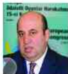
Khazar ISAYEV Chairman of the Azerbaijan Fair Play Commission