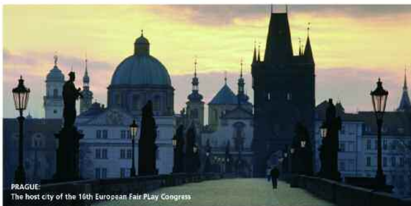
PRAGUE: The host city of the 16th European Fair Play Congress

Historic city in Central Europe ready for 16th Congress