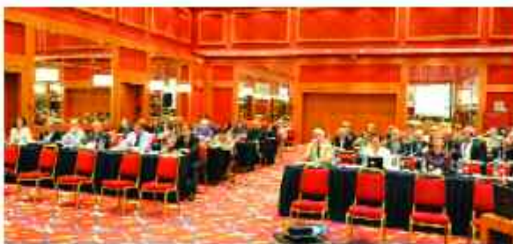
Representatives of various countries observe the Congress in Baku.

cussion in the following words: "First of all, sports writers and journalists need to believe in Fair Play. They need to acquire the necessary sensitivity to it; only then will they be able to put it in-