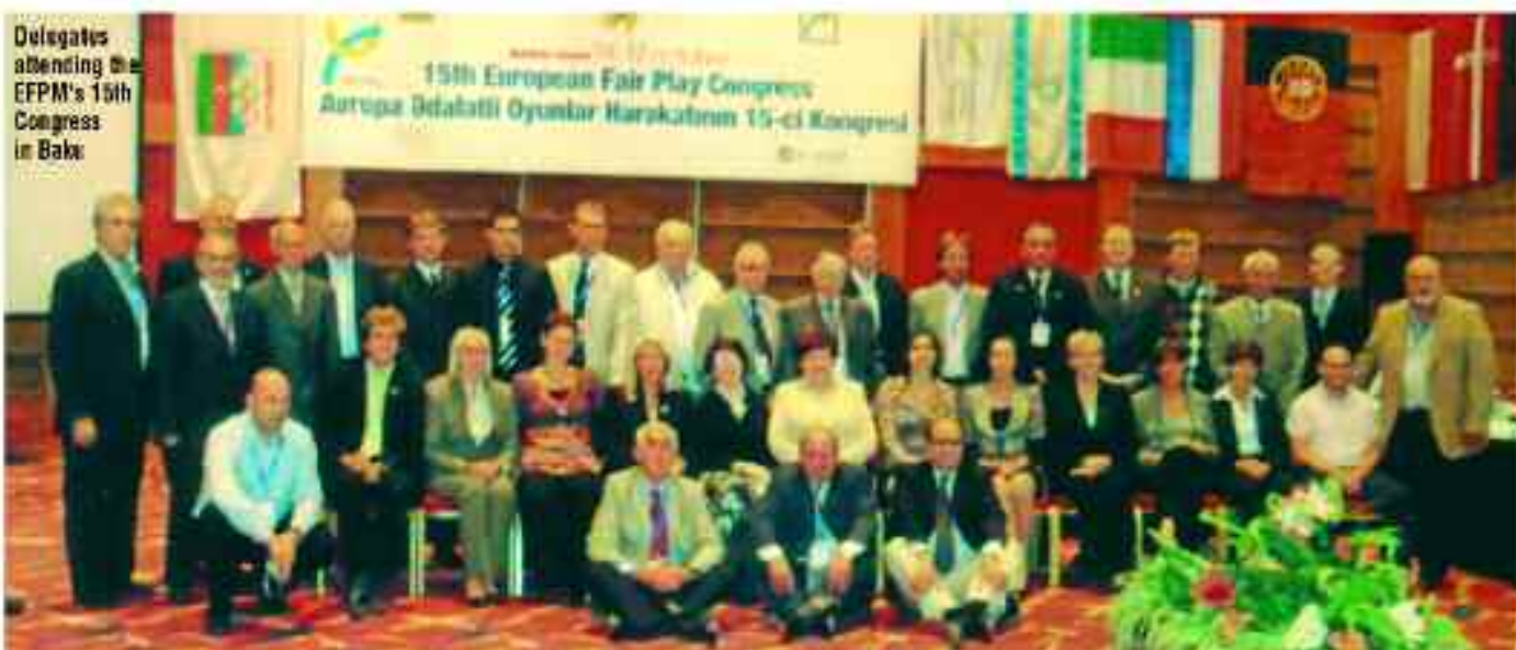
Delegates attending the EFPM's 15th Congress in Baku