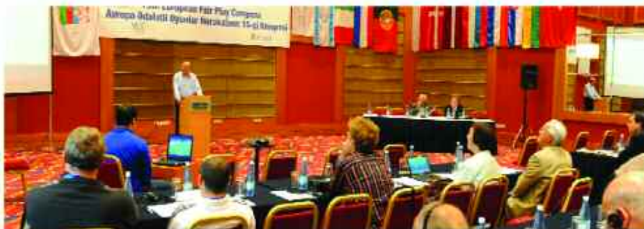
A GENERAL VIEW OF THE 15th EUROPEAN FAIR PLAY CONGRESS