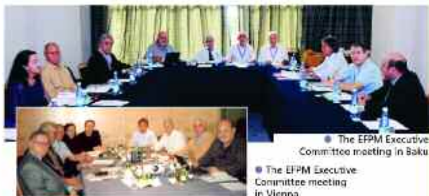
The EFPM Executive Committee meeting in Baku