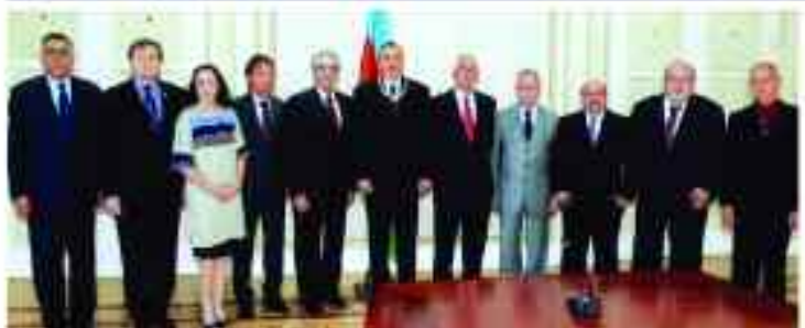
WITH THE PRESIDENT: The EFPM Executive Committee with officials from the Azerbaijan Fair Play Commission at the presidential palace.