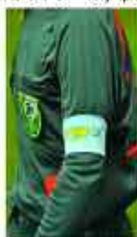
THE ARMBAND: The referees for the matches showed their support for the exhibition by wearing this armband.