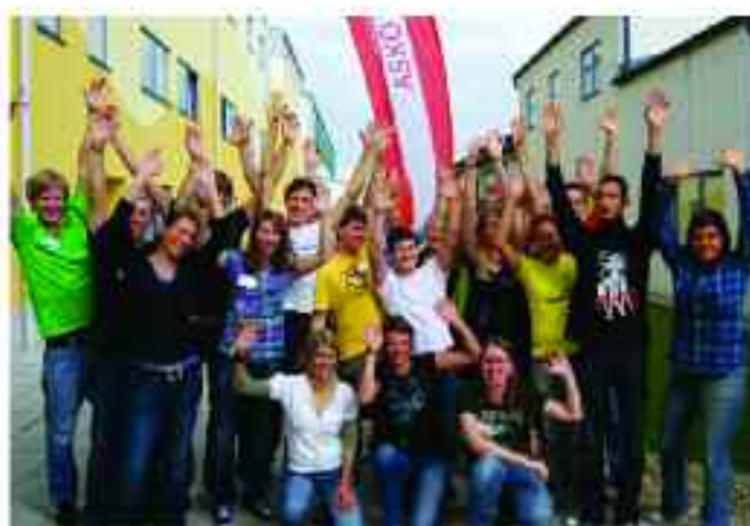
ASKOE YOUTH CONFERENCE IN STEINBRUNN, SEPTEMBER 2009

last Conference in September 2009 was "Streetsoccer for Tolerance". After a short presentation of the worldwide successful initiative the participants had the chance to try out this game. Then they discussed ways to transfer this method of playing to other ball-sports.