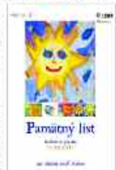
The poster for the exhibition in Kosice