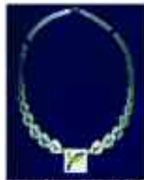
The 'Chain of Merit' Award

On 13th October 2009, the Executive Committee met once again in Baku - just before the opening of the Congress.