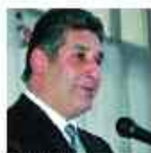
Azad RAHIMOV Azerbaijan Minister of Youth and Sports