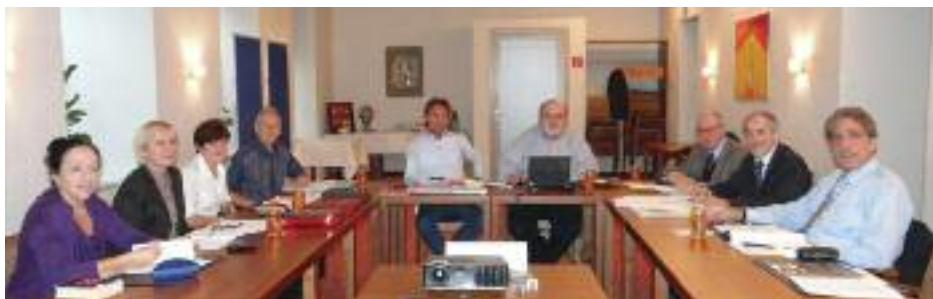
The EFPM EC's first meeting in Vienna, where its new headquarters is to be located