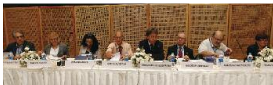
Executive Committee at the EFPM General Assembly