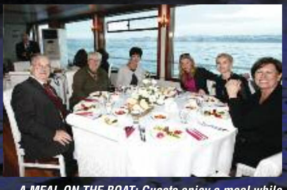
A MEAL ON THE BOAT: Guests enjoy a meal while admiring the view during our Bosphorus boat trip