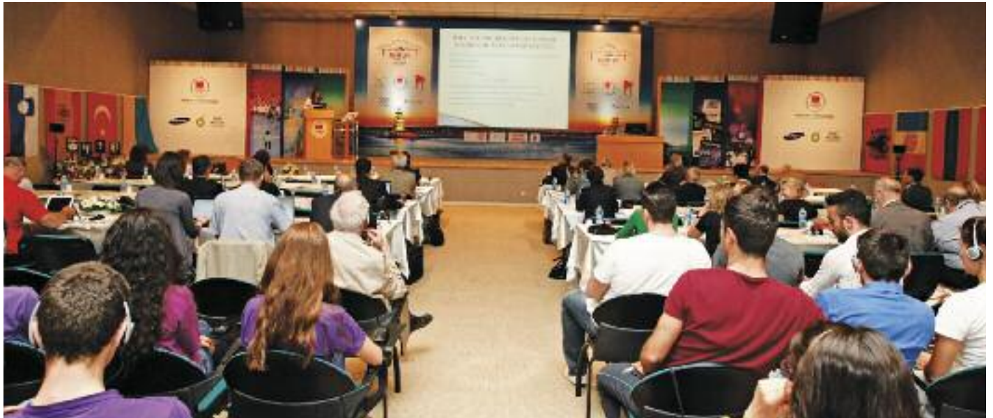
DELEGATES AND GUESTS AT THE 19th EUROPEAN FAIR PLAY CONGRESS.