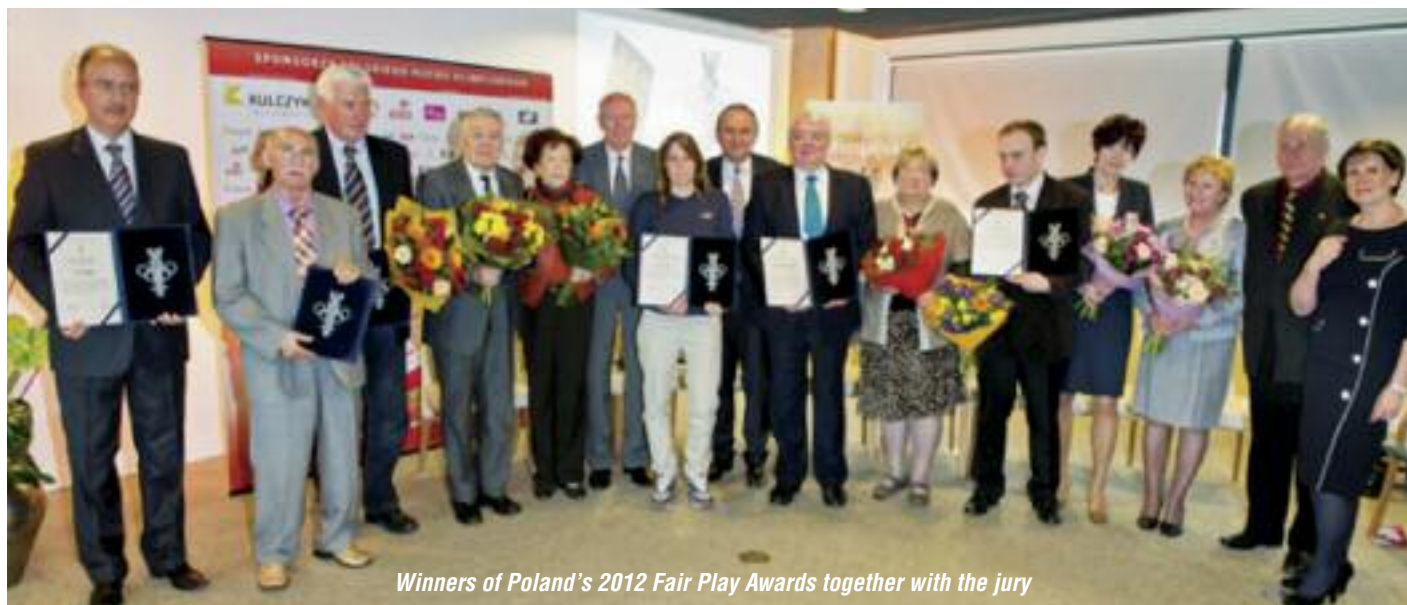
Winners of Poland's 2012 Fair Play Awards together with the jury

Three awards for a Sporting Career and a Life Lived according to the Principles of Fair Play (including social and professional activity in sport) were given to the following: