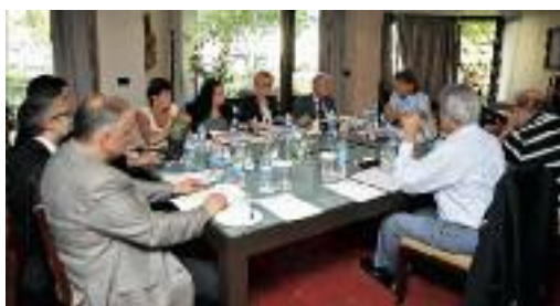
The EFPM EC's meeting in Istanbul before the 2013 Congress

The newly-elected EFPM Executive Committee began work after the 18th EFPM Congress in Verona. Three meetings were held during this time – two in Istanbul and one in Vienna. At the first meeting in Istanbul in the spring of 2013, the main topics on the agenda were the 19th Congress (which was to be held in Istanbul) and the reorganisation of the EFPM. It was decided that from now on the EFPM would have a permanent headquarters, and that this headquarters should be located in Vienna; it was further decided that the organisation's bank accounts should be moved to Vienna and that its statutes should be modified in accordance with the move. The EC also re-