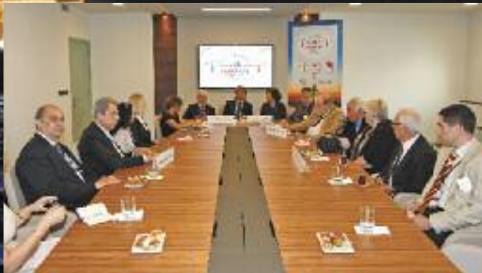
THE PRESS CONFERENCE: The Organising Committee for the Istanbul Congress and the EFPM EC hold a press conference at Olympic House in Istanbul