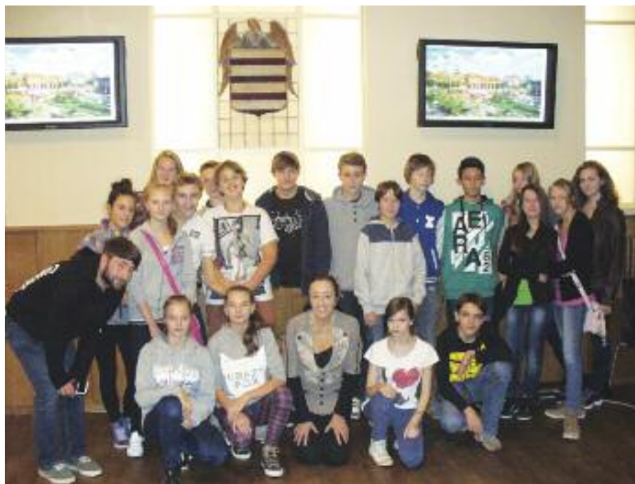
A group of participants in the workshop on Fair Play