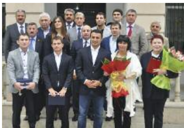
A group photograph of winners of the Azerbaijan Fair Play Awards

awards were presented. During the ceremony it was announced that the EFPM will be present at the European Games in Baku, and that Fair Play Awards will be given at this event.