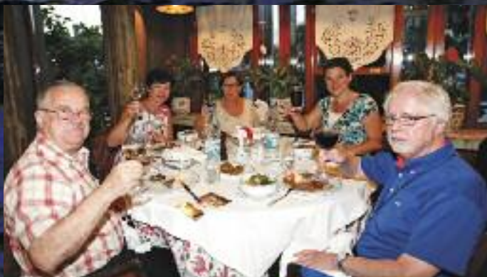
A MEAL TO WELCOME NEW ARRIVALS: Everyone has a good time at the world-famous Beyti Kebab Restaurant in Istanbul