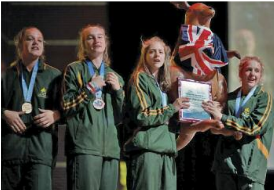
The Fair Play Award is presented to the girls' 4X100-metre relay team from Macquaria, Australia