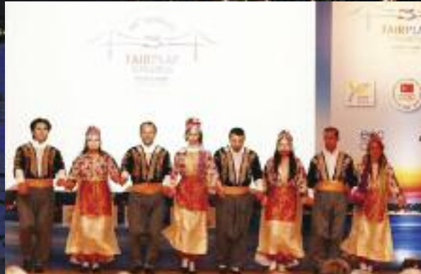
FOLK DANCING: An eye-catching display of folk dancing is held at the opening of the Congress