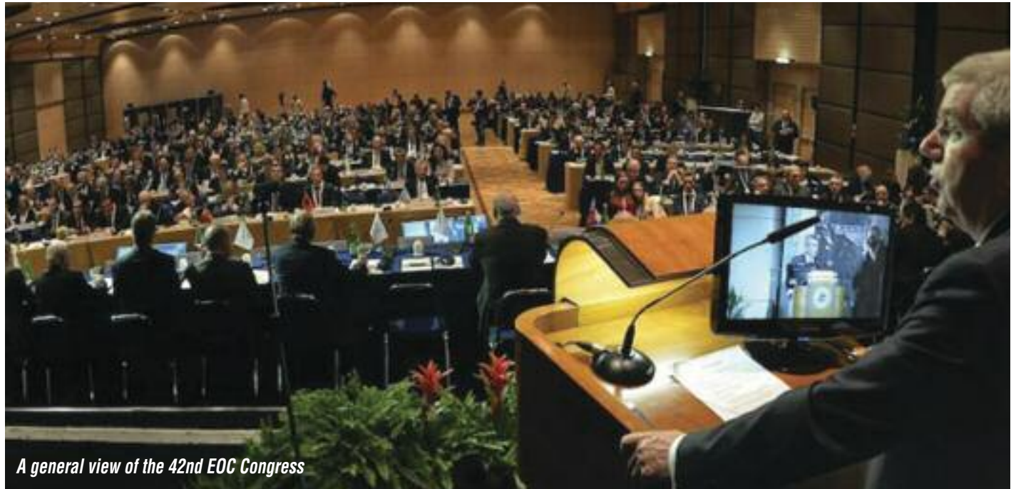
A general view of the 42nd EOC Congress