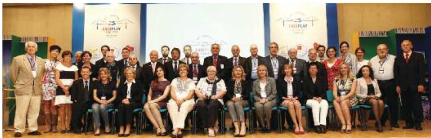
A group photograph of EFPM Members at Olympic House after the 19th Congress in Istanbul