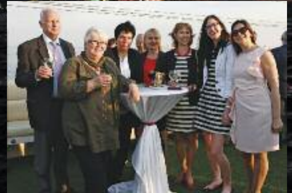
CHEERS!: Glasses are raised to drink the EFPM's health during our boat trip