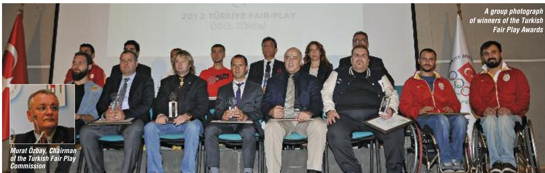
A group photograph of winners of the Turkish Fair Play Awards