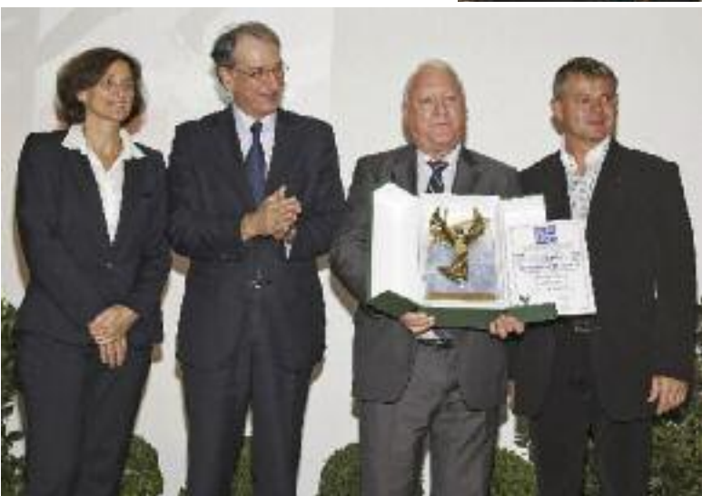
AN OUTSTANDING CAREER: The Jury's Special Award is presented to Alain Calmat – surgeon, government minister, member of parliament, mayor and French International Sports Ambassador