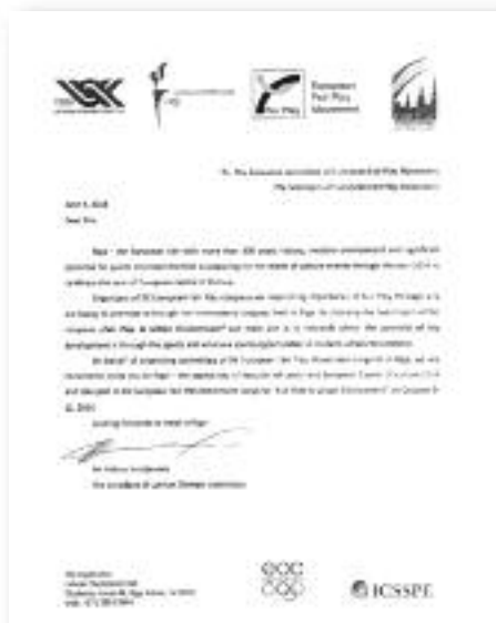
SEE YOU IN RIGA: The letter of invitation from the Organising Committee for the Riga Congress