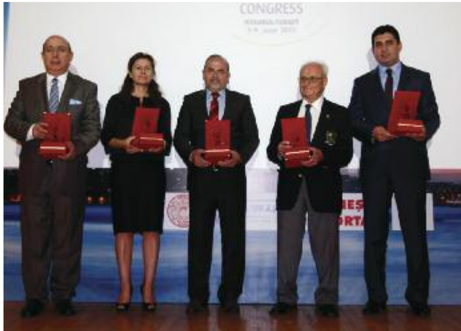
We thank our sponsors: Plaques are awarded to the sponsors of the 19th EFPM Congress at the conclusion of the event as tokens of our gratitude for their support. Seen here are representatives of the following: (from left to right) the Turkish Sports Writers' Association; Güneş Sigorta (Insurance); Spor A.Ş.; the Hacibekir Company; and the Press Notices Board.

the German Sport Council (speaking on behalf of Turkey), who gave an analysis of 'Precautions against violence in Sport in Europe and the situation in Turkey';