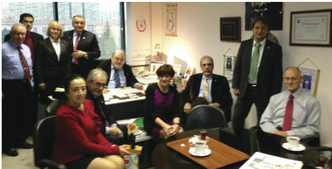
The EFPM Executive Committee in the office of the Turkish Fair Play Commission

The General Secretary informed the members of the General Assembly that the EFPM Awards for 2013 will not be given owing to modifications to the EFPM Awards Regulations that have been decided on by the Executive Committee. The new regulations will be com-