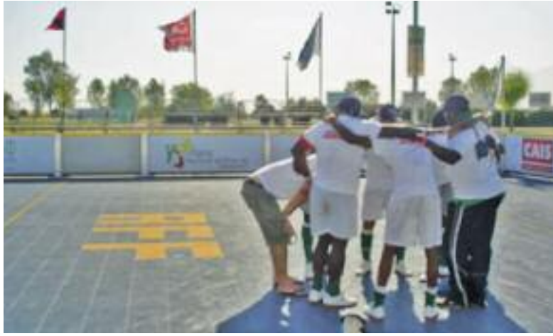
Portuguese young people take part in Fair Play activities