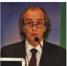
Esad YILMAER (AIPS, Vice-President)

'Olympism vs fair play. Respect as the primary ethical value of sports'