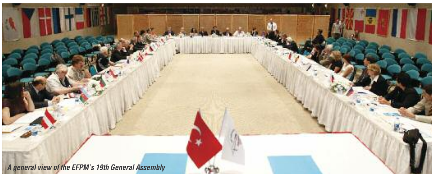
A general view of the EFPM's 19th General Assembly