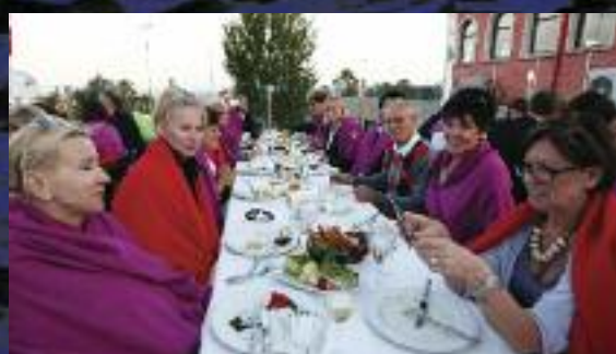
AN EXCELLENT FISH MEAL: On their last night, our guests enjoy a good meal at a famous fish restaurant