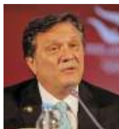
Hasan Arat (Turkey), one of the newly-elected members of the EOC Executive Committee