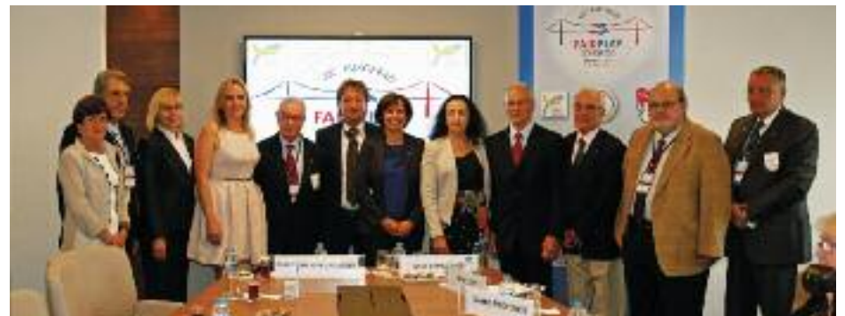
THE PRESS CONFERENCE: A briefing on the 19th Congress is given for the Turkish media at a press conference at Olympic House