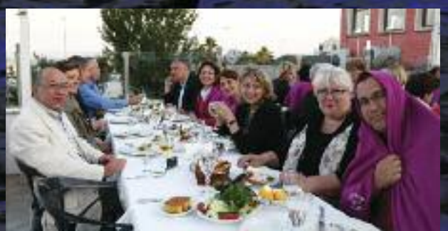
THE WEATHER DID NOT PLAY FAIR: The food was good and the atmosphere warm, but the weather quickly went cold – producing an unforgettable sight!