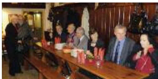
The dinner given by ASKÖ for the EFPM EC in Vienna