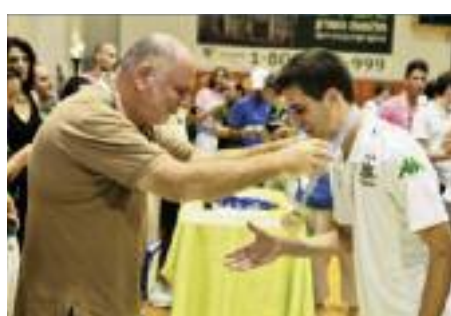
The South African junior basketball team receive their award