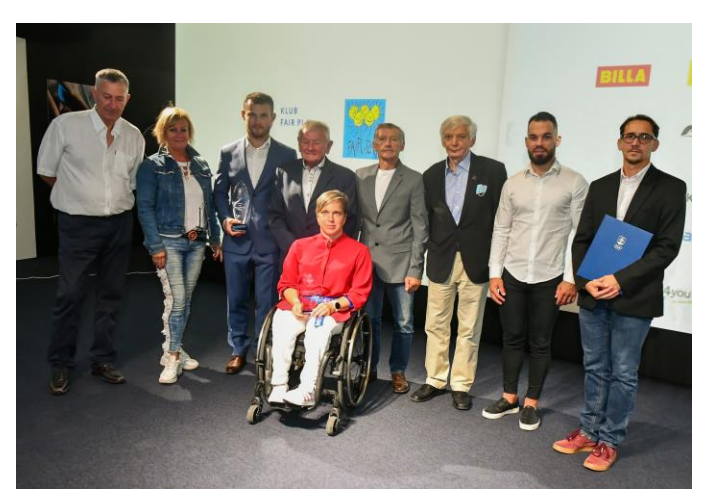
European Fair Play Movement 1030 Vienna, Maria Jacobi Gasse 1, Austria Webpage: www.fairplayeur.com www.facebook.com/EuropeanFairPlay/ Under the Patronage of the EOC

The SOSC as well as members of the SOSC FPC are highly appreciative that despite the complicated period that we have all been going through, there are still people whose life stories prove that they are justifiable role models who can mould the thoughts and actions of our younger generations.