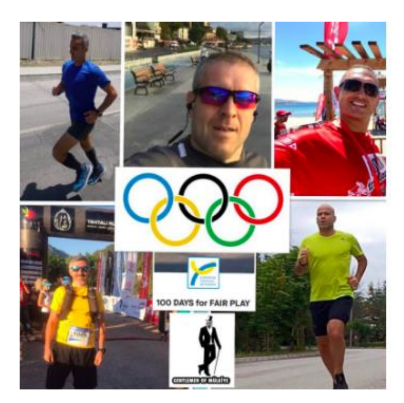
European Fair Play Movement 1030 Vienna, Maria Jacobi Gasse 1, Austria Webpage: www.fairplayeur.com www.facebook.com/EuropeanFairPlay/ Under the Patronage of the EOC