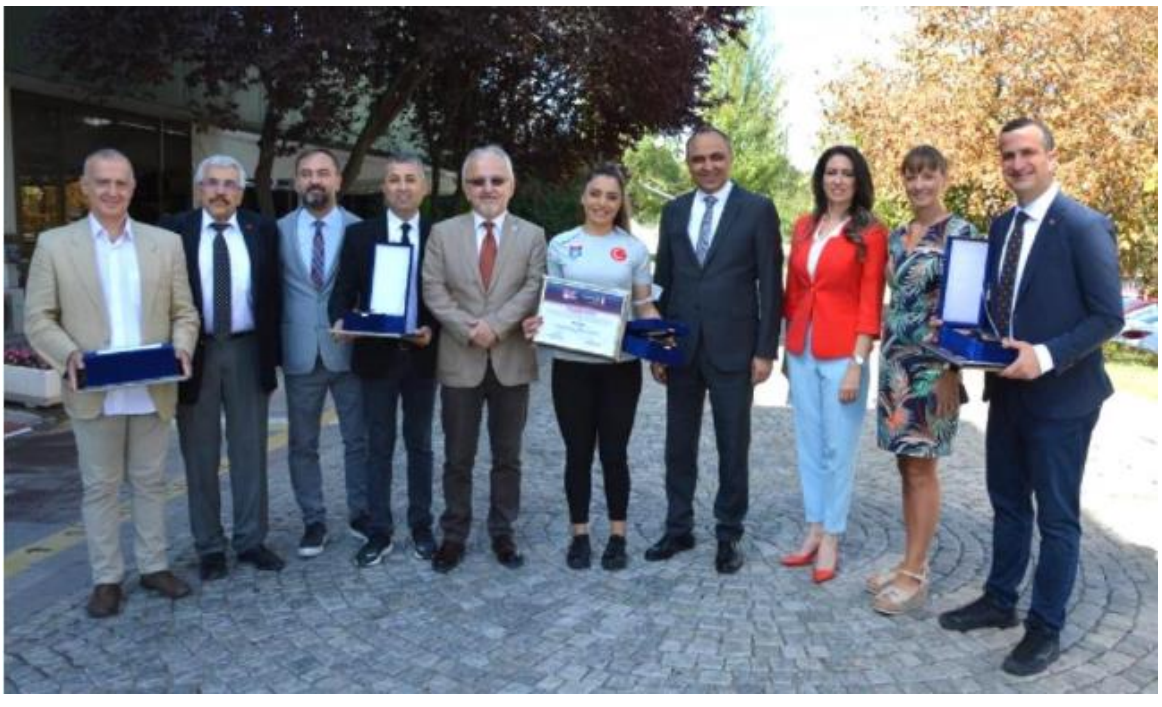
European Fair Play Movement 1030 Vienna, Maria Jacobi Gasse 1, Austria Webpage: www.fairplayeur.com www.facebook.com/EuropeanFairPlay/ Under the Patronage of the EOC